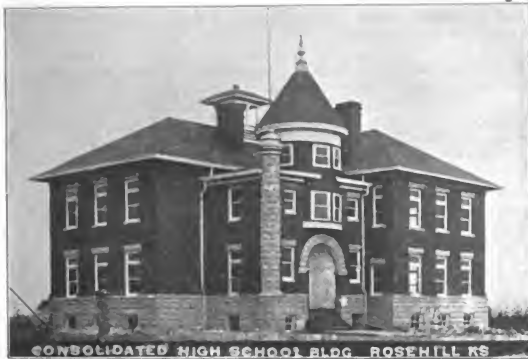
CONSOLIDATED SCHOOL AT ROSE HILL.

The early superintendents of public instruction advised a compulsory law and in 1903 the legislature passed an act requiring that all children